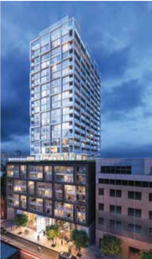
52 LAMB DEVELOPMENT CORP. East 55 East 55 Condos presents the future of condo living