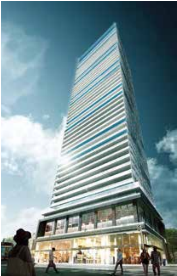
62 CENTRECOURT DEVELOPMENTS Grid Condos A lesson in location, value and smart design