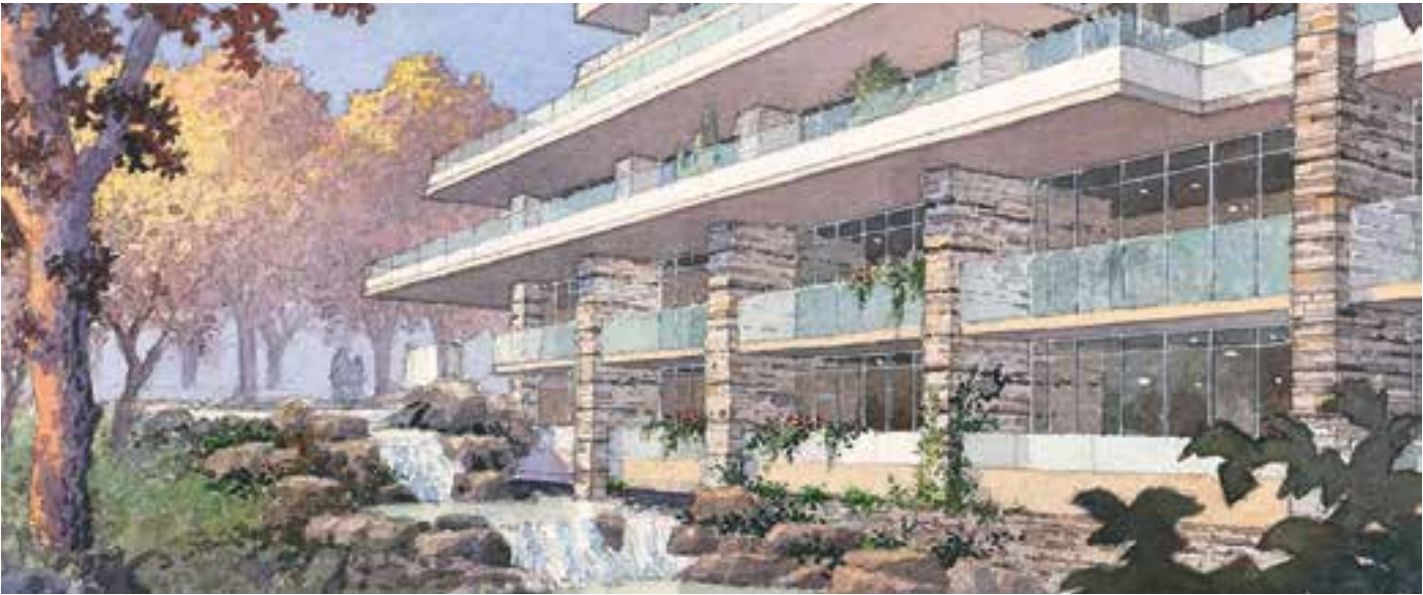
42 URBAN CAPITAL AND ALIT DEVELOPMENT The Ravine The Ravine offers families the ultimate backyard